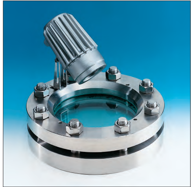
Application as combined sight and light port on a sight glass fitting acc. to DIN 28120, mounting by way of hinged bracket.